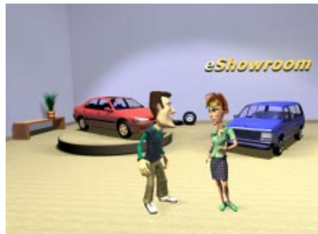
Figure 2. The agents Tina and Ritchie engaging in a car sales dialogue in the IMP.

From the point of view of the system, the presentation goal is to provide the user with facts about a certain car. However, the presentation is neither just a mere enumeration of the plain facts about the car, nor does it assume a fixed course of the dialogue between the involved agents. Rather, IMP supports the concept of adaptivity. It allows the user to specify prior to a presentation (a) the agents' role, (b) their attitude towards the product (in our case a car), (c) their initial status, (d) their personality profile and (e) their interests. Taking into account these settings, a variety of different sales dialogues can be generated for one and the same product.