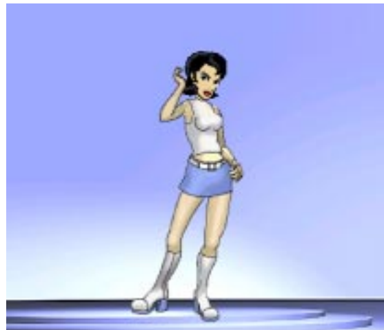
Figure 1. The presentation agent Cyberella.

The last decade has seen a general trend in HCI to make human-computer dialogue more like human-human dialogue. Computers are ever less viewed as tools and ever more as partners or assistants to whom tasks may be delegated. Trying to imitate the skills of human presenters, some R&D projects have begun to deploy animated agents (or characters) in wide range of different application areas including e-Commerce, entertainment, personal assistants, training / electronic learning environments [4, 9]. Based either on cartoon drawings, recorded video images of persons, or 3D body models, such agents provide a promising option for interface development as they allow us to draw on communication and interaction styles with which humans are already familiar.